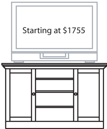
RC-3557 or WC-3557 (35.25"H X 57"W X 21"D) RC-2457 or WC-2457 (24"H X 57"W X 21"D) Holds up to 21" wide center speaker